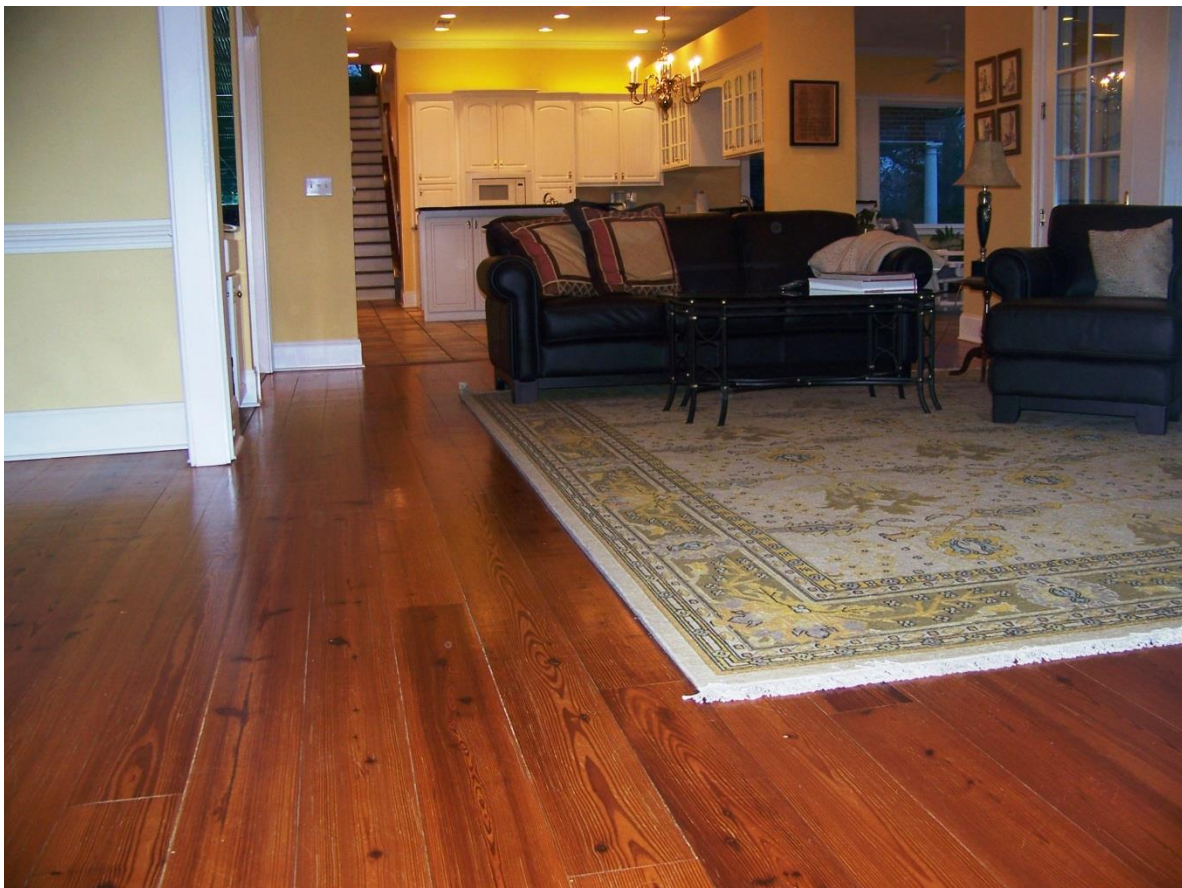
Real Heart Pine Floors