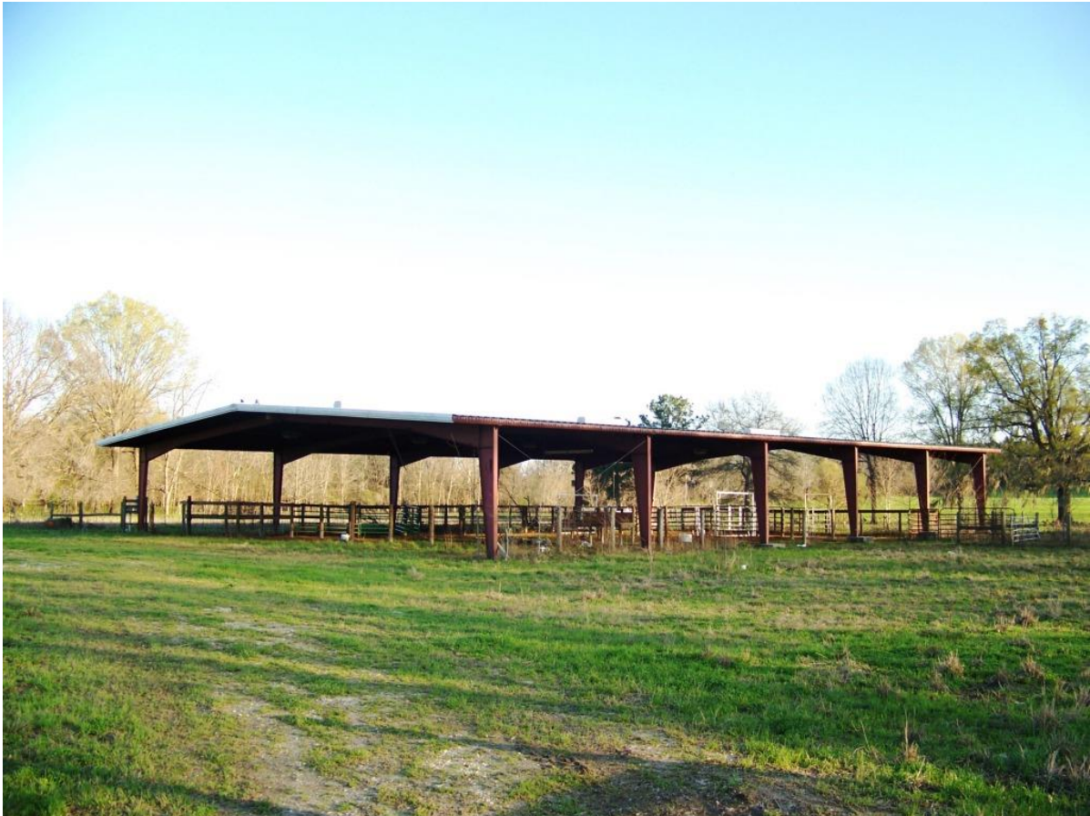
Large Arena Barn