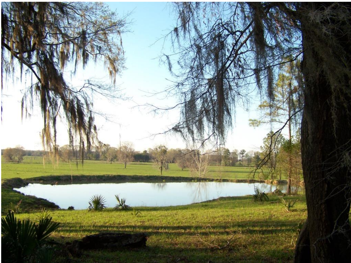
View of Pasture with small Livestock Water Pond