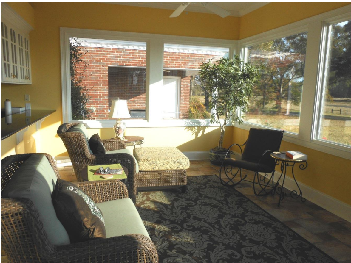
Breakfast Area Off From Kitchen With Spectacular View of Farm