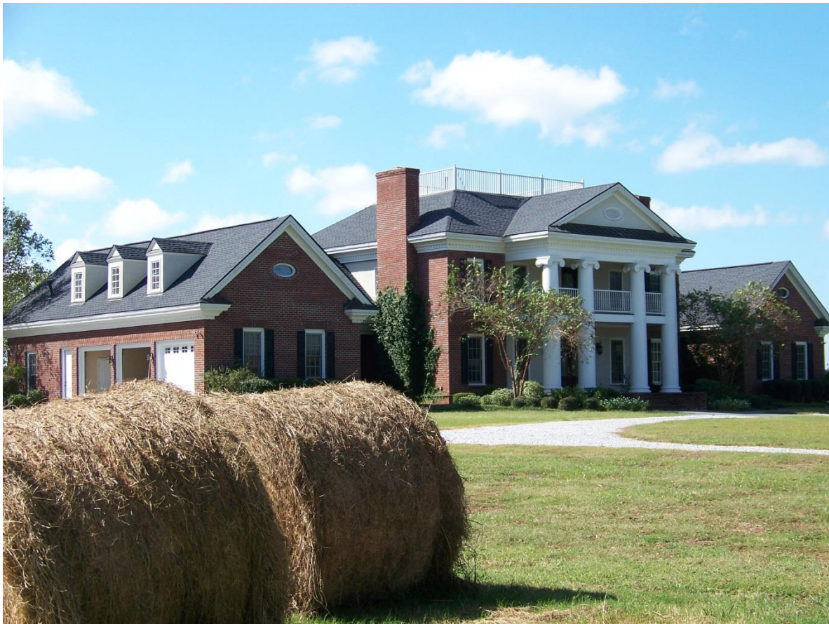
Front View of House