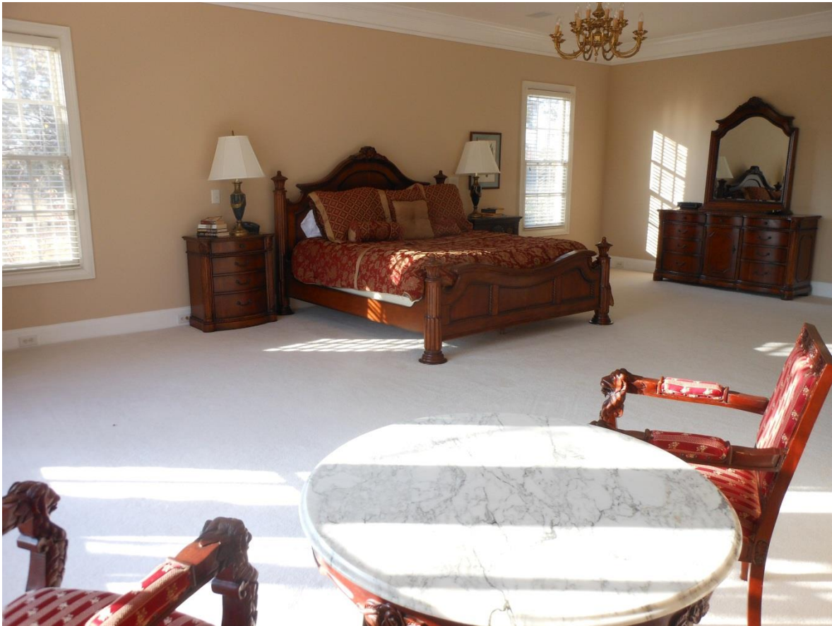
Large Master Bedroom