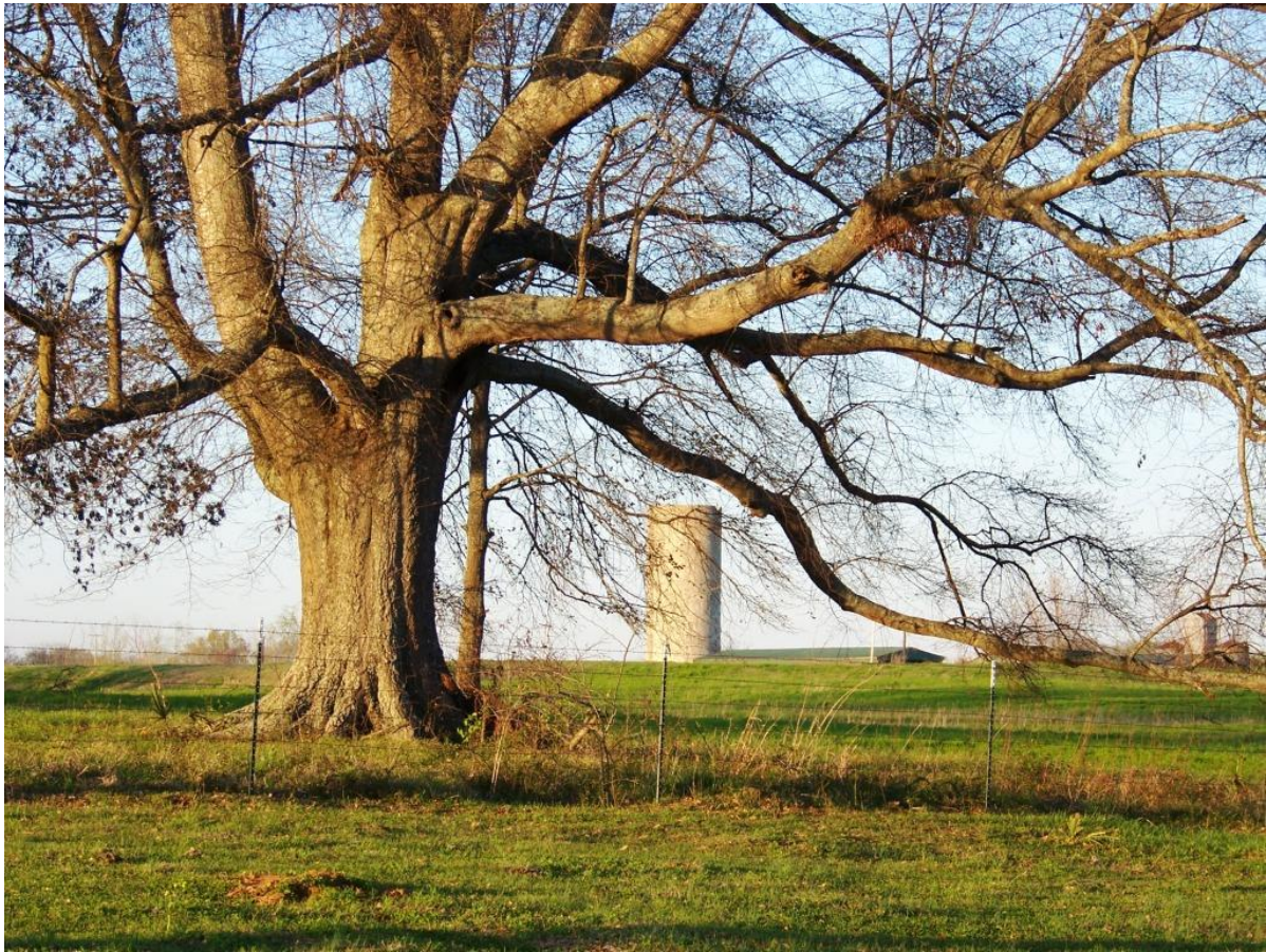
View of Pasture