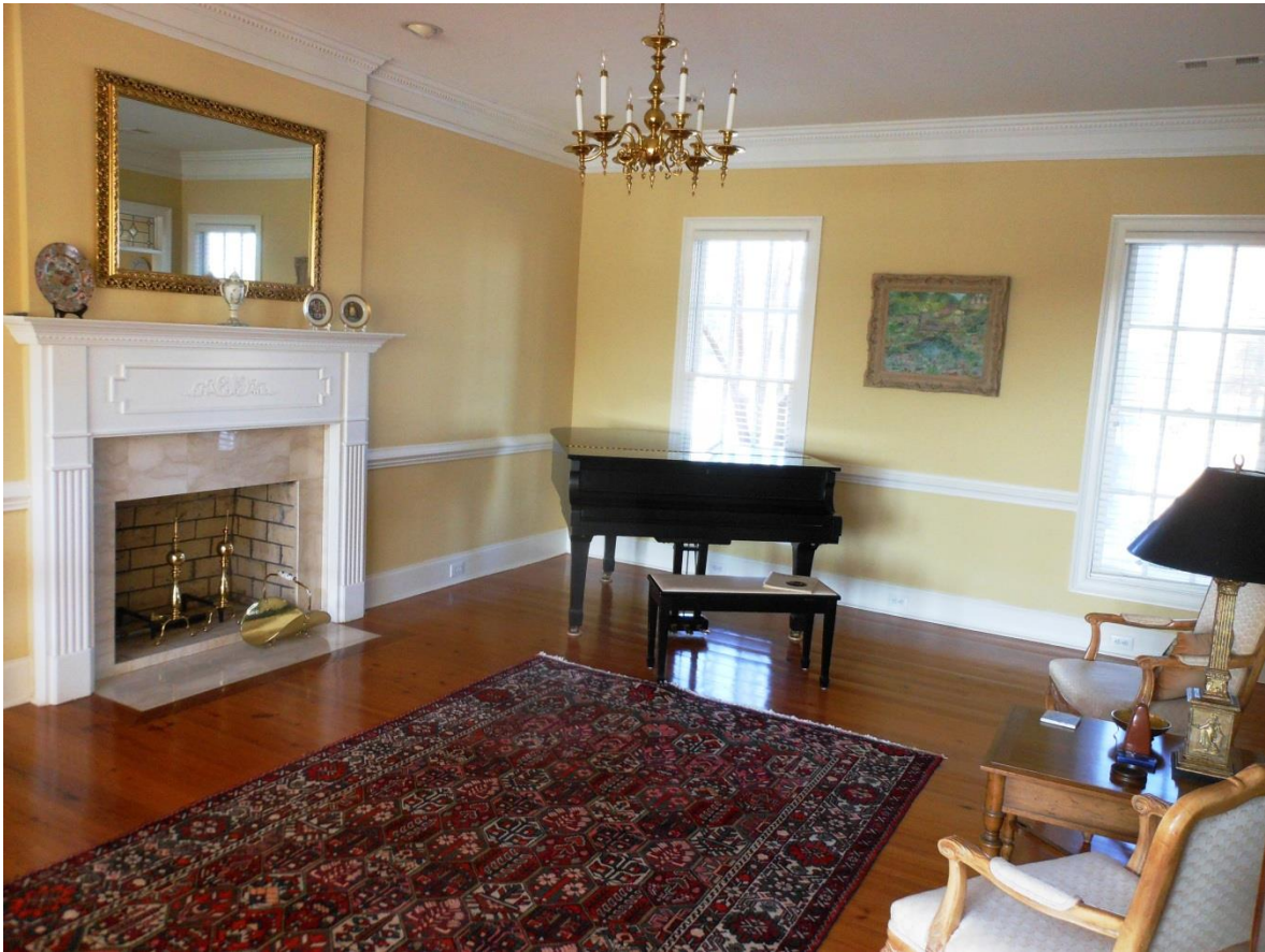
Formal Living Room