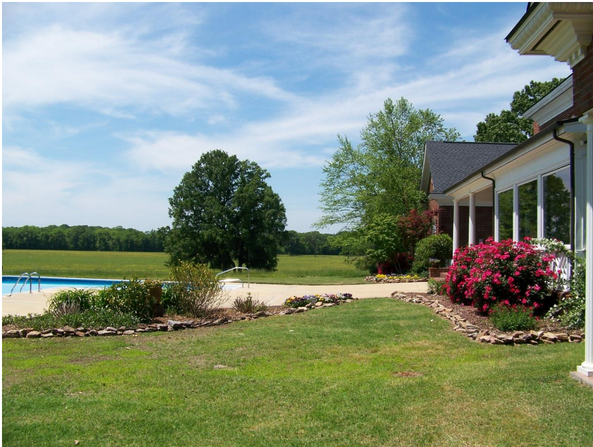
View of Rear of House