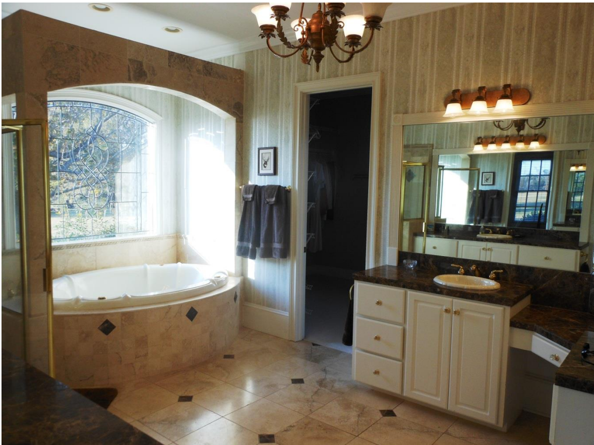
Spacious Master Bathroom