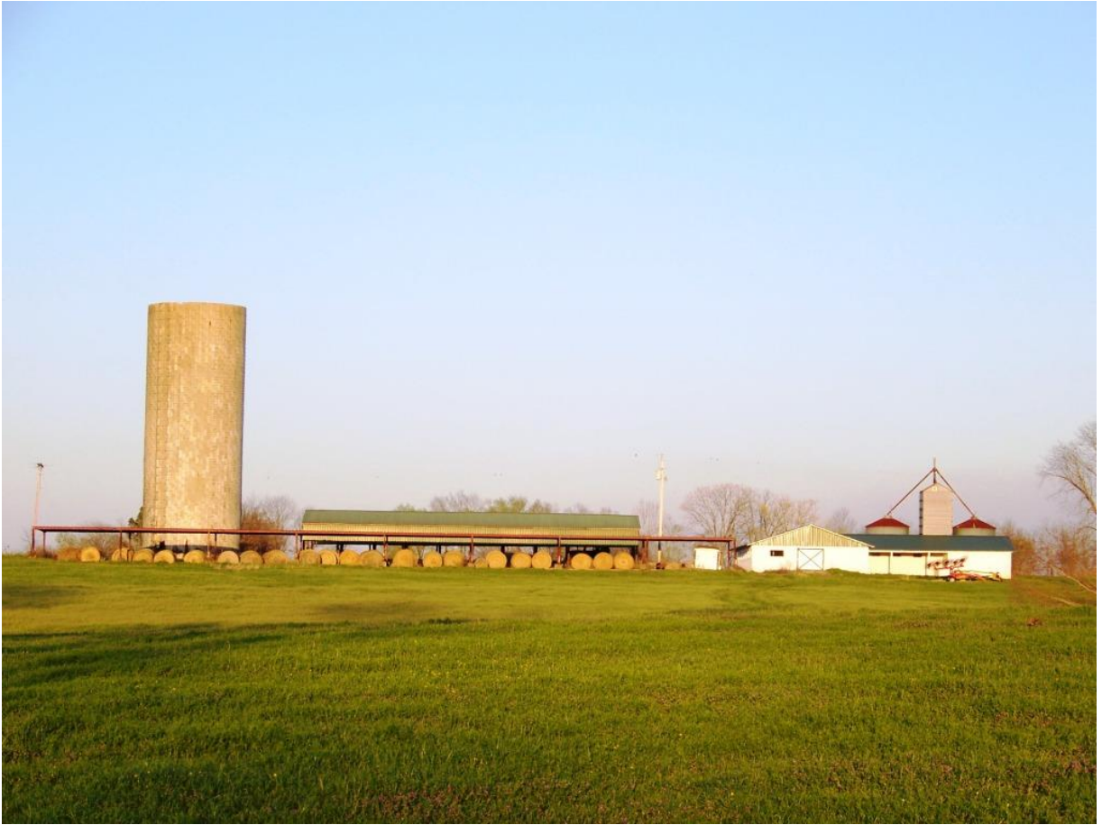
View of Hay Barn, Refurbished Dairy Barn and Old Silo