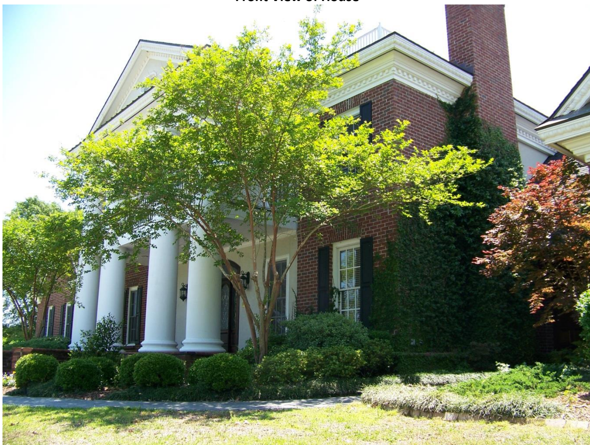
Well Landscaped Grounds