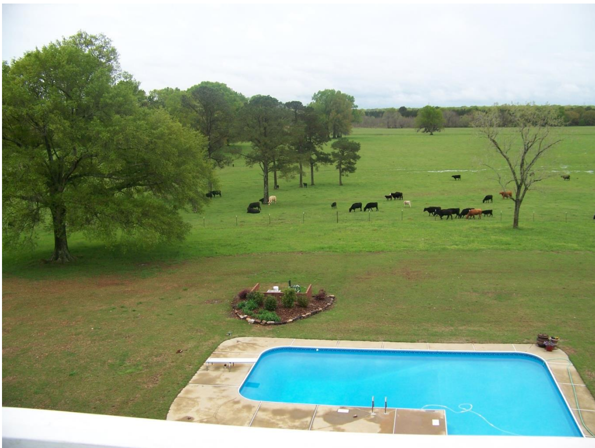
View of The Back Yard From Upstairs