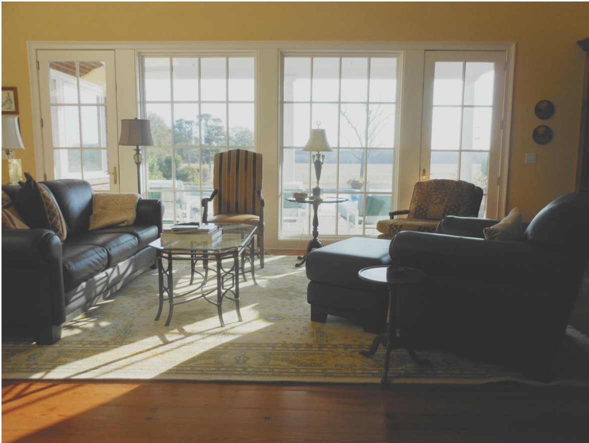
Den With Double Doors that Lead to Patio and Pool